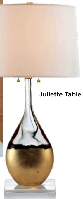
Juliette Table Lamp

The Juliette Table Lamp balances the weight of the headboard while providing bedside illumination.